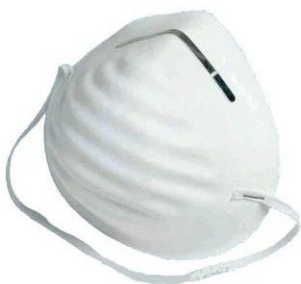
Disposable dust mask

Machines or processes that generate dust or fumes should have a proper exhaust system fitted. The exhaust system of such equipment should be inspected on a regular basis. Machines that are used on an infrequent basis with no exhaust system, the use of dusk masks is required. Areas where dusk masks are mandatory should clearly be indicated by warning signs.