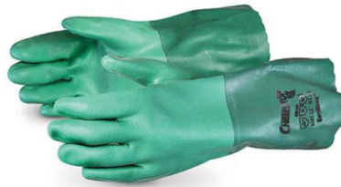
Neoprene gloves for chemicals