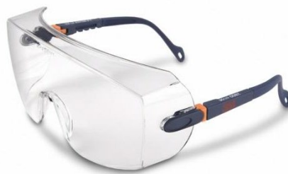
Safety over specs