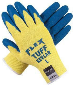
Kevlar gloves for cutting

Safety gloves MUST be available at all times on the employee's person in production areas.