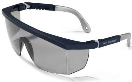
Standard safety glasses with side shields

During all grinding, skiving, drilling operations, safety glasses with side shields are required to be worn. Regular glasses are NOT suitable to perform such tasks unless they are prescribed safety glasses by an approved optician. For people that normally wear spectacles, safety over specs is available. Warning signs should clearly indicate the areas where safety glasses are mandatory. Safety glasses MUST always be available on the employee's person in production areas. Safety glasses are recommended to be worn by all employees on the shop floor. Visitors must always wear safety glasses in production areas.