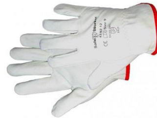
Regular work gloves